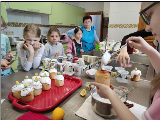
Baking Easter bread