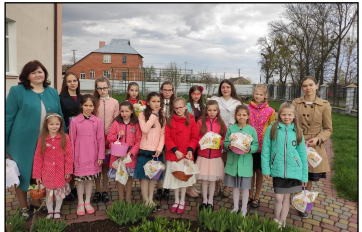
Blessing the Easter Baskets