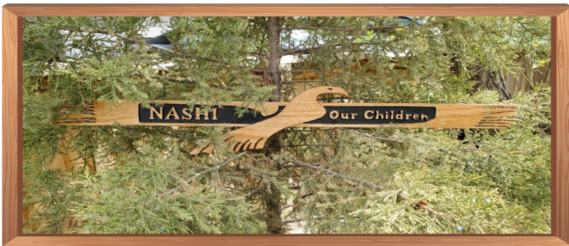
Wood Carving done by Jerome Beley, a friend of NASHI

The greatest gift you can give children are the roots of responsibility and the wings of independence.