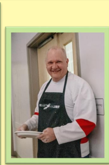
A SUMO WRESTLER MAKES AN APPEARANCE AT PEROGY PARADISE