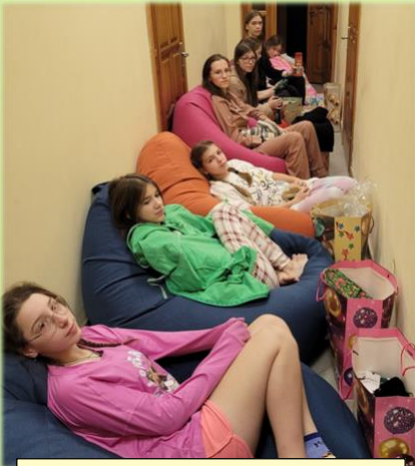
"Safe space" in house when the sirens alarm

As Canadians we have real difficulty imagining what life would be like living in a conflict zone. What we currently are worried about is potholes in the pavement. We could hardly live with severe power and water shortages and constant air raid sirens. This is life for our girls who are now back in Ukraine.